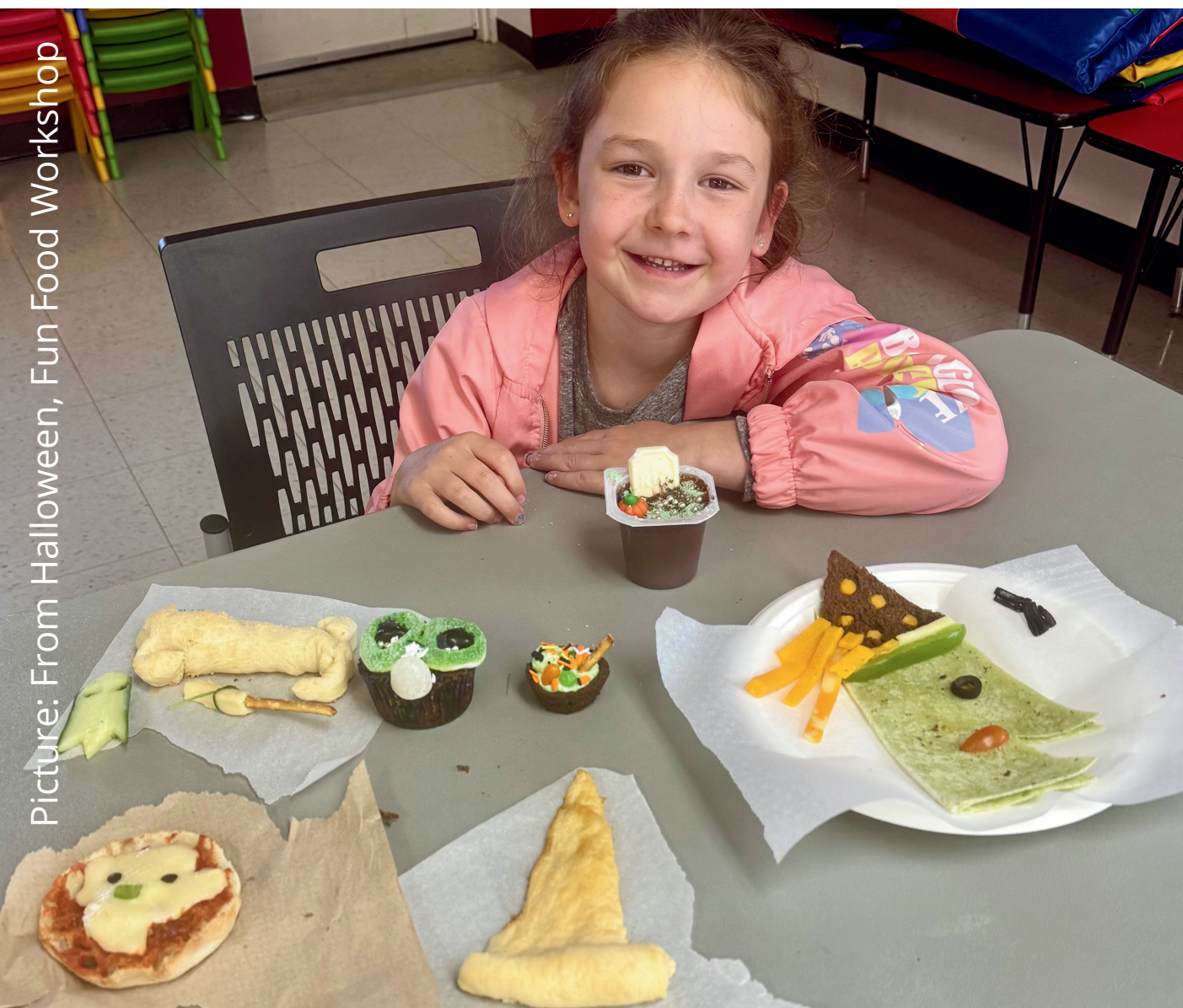
Picture: From Halloween, Fun Food Workshop